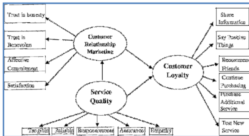
Figure 1 Maximizing the Provision of Integrated-Based Public Services

Organizers may cooperate with other parties in the form of delegating part of the tasks of administering public services to other parties provided that the cooperation agreement is stated in accordance with statutory regulations and in practice it is based on service standards; the operator is obliged to provide information related to the cooperation agreement to the public; the responsibility for the implementation of the cooperation lies with the recipient of the cooperation while the overall responsibility for the implementation lies with the operator; information related to the identity of other parties and the identity of the organizer as the person in charge of the activity must be stated by the organizer in a place that is clear and easily known by the public; and organizers and other parties have the obligation to include the address where the complaint is made and facilities for accommodating public complaints that are easily accessible, including telephone, short message service, website, e-mail, and complaints box. The other party referred to in this case must be an Indonesian legal entity in accordance with statutory regulations. The cooperation that is organized does not add to the burden on the community and in the context of organizing public services.